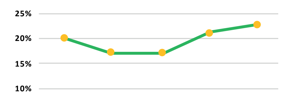
NPL Ratio - Gross loans for the period ended 30 September